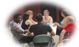
Students celebrate the end of May 2016 exams at a picnic sponsored by WSHS IB Boosters